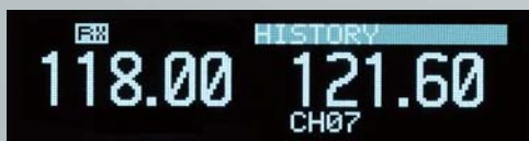
Operating information is clearly shown on the OLED display.

A fixed mount VHF airband first! The IC-A210E has an organic light emitting diode (OLED) display. The OLED display emits light by itself and the display offers many advantages in brightness, vividness, high contrast, wide viewing angle and response time compared to a conventional display. In addition, the auto dimmer function adjusts the display for optimum brightness at day or night.