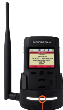
PMPN4142A Home Station